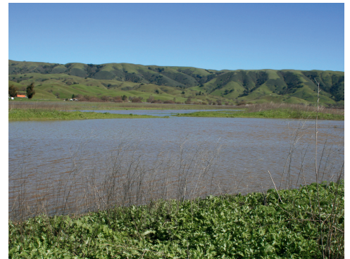
Soap Lake Ranch Conservation Easement