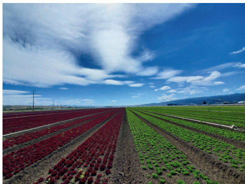
Silva Ranch Conservation Easement